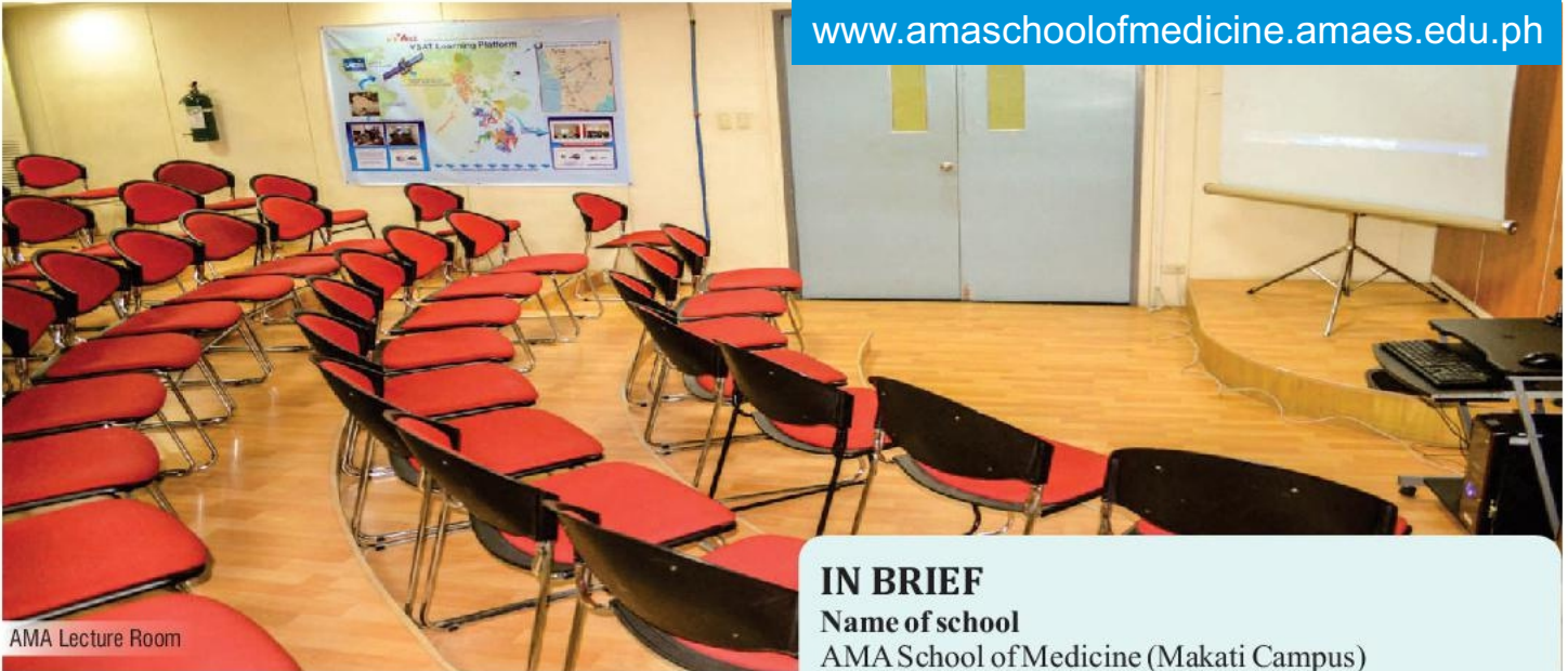
AMA Lecture Room