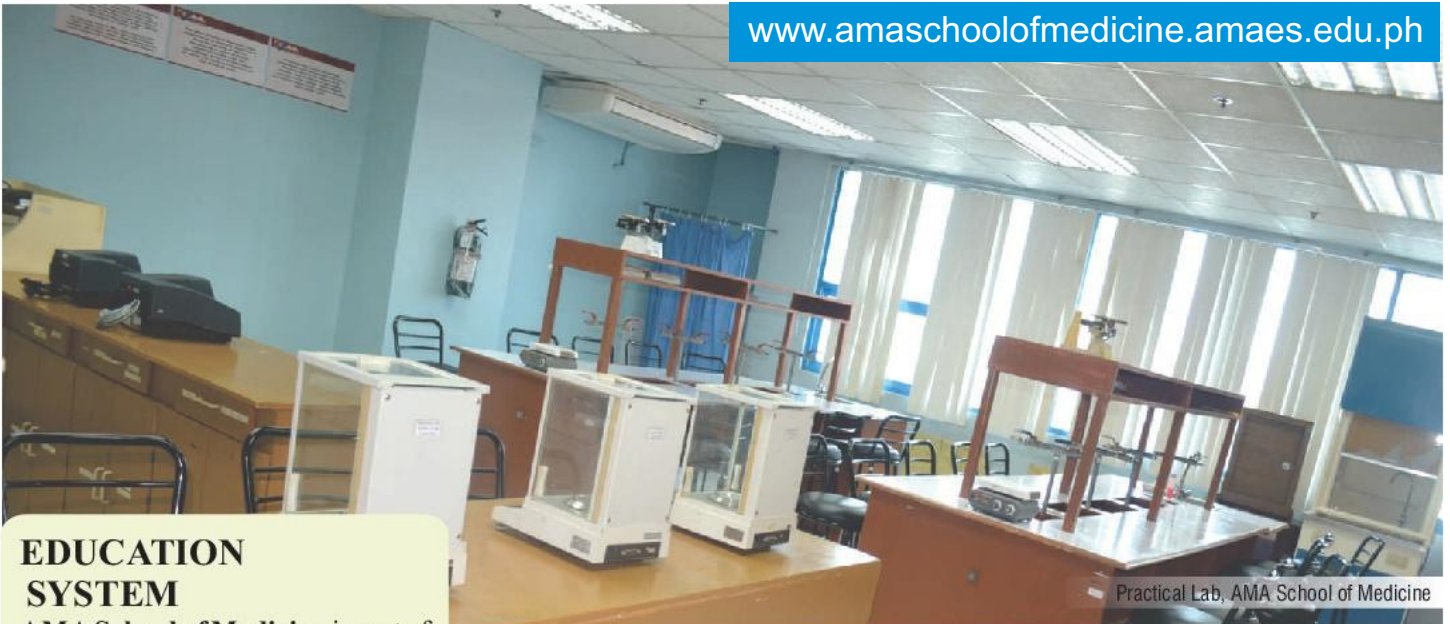
Practical Lab, AMA School of Medicine