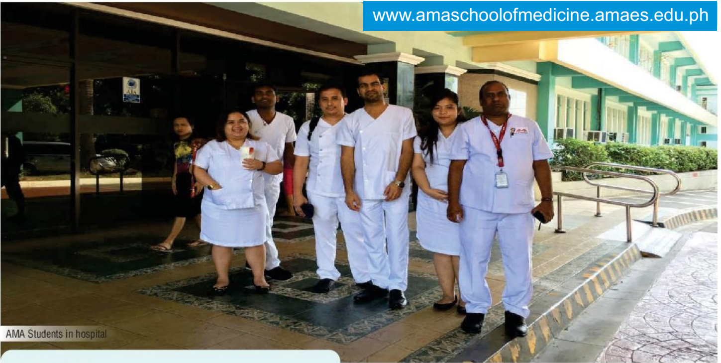
AMA Students in hospital