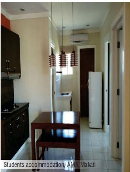
Students accommodation, AMA Makati