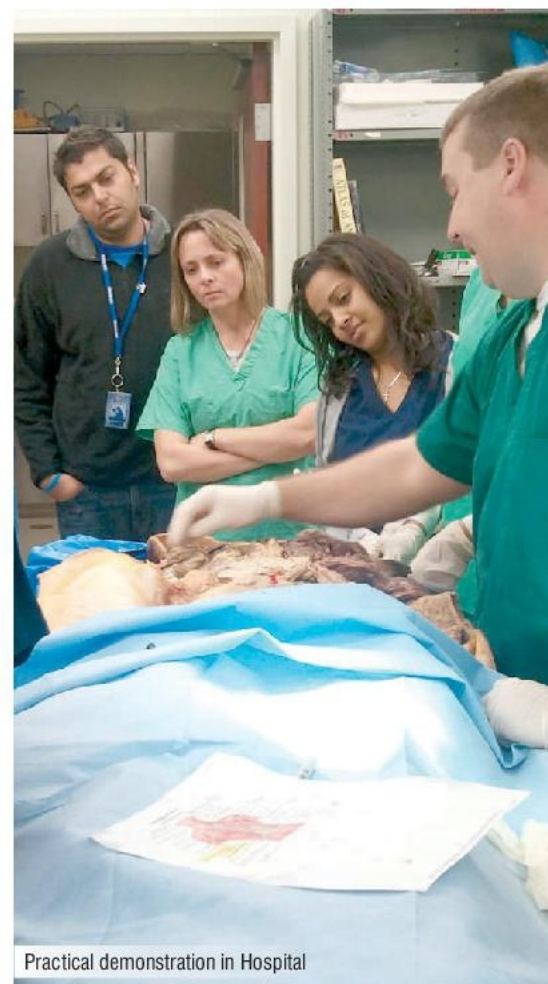
Practical demonstration in Hospital

MCI preparation : Study material will be provided in Manila. Followed by coaching in INDIA to ensure 100% MCI pass rate (At students own cost).