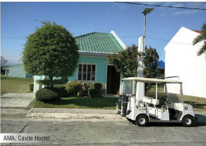
AMA, Cavite Hostel

There are plenty of eating places nearby. India food / catering arrangements are made for students from India. Laundry arrangements are there for students.