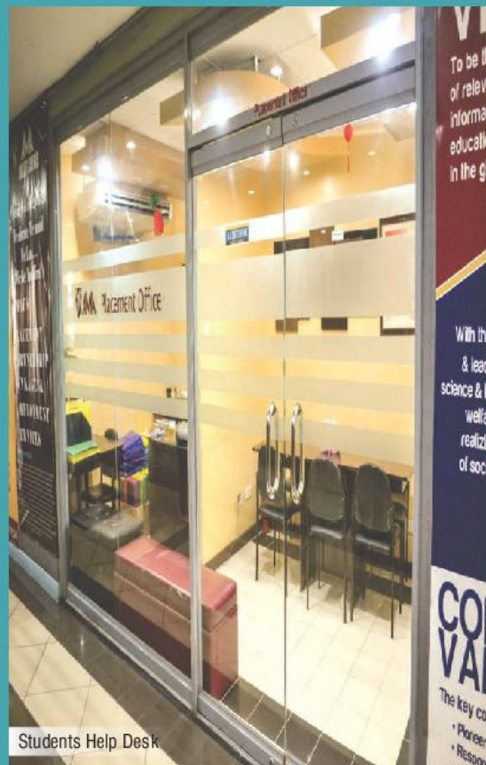
Students Help Desk