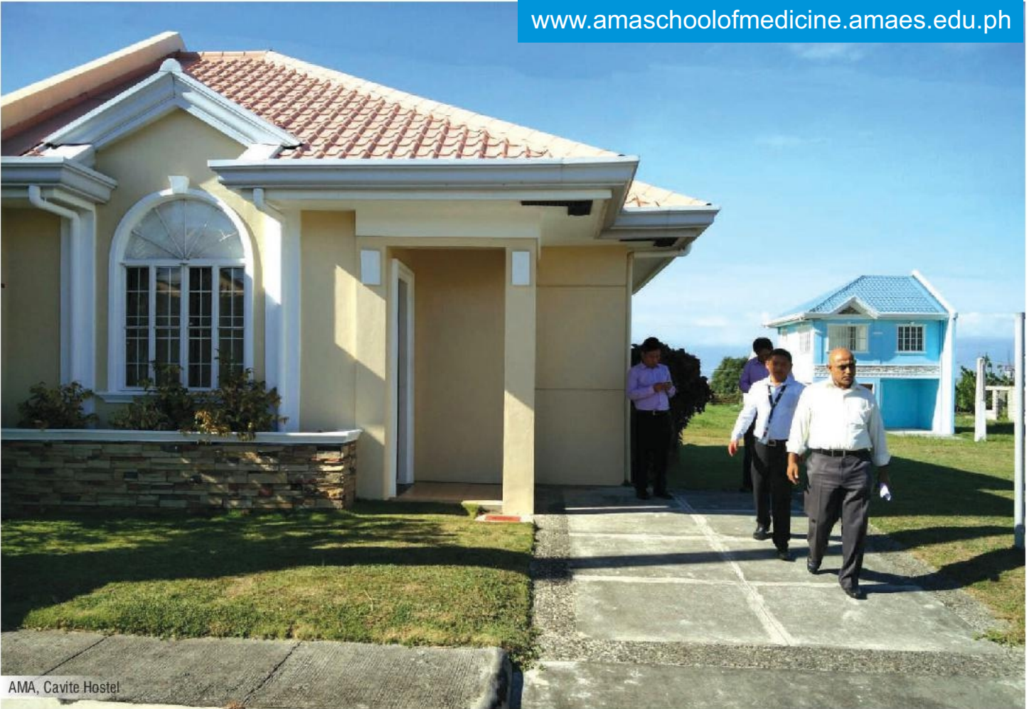
AMA, Cavite Hostel