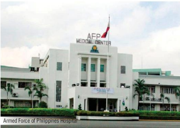
Armed Force of Philippines Hospital

Indian Students from AMA School of Medicine are eligible for MCI Screening test and be licensed to practice in India.