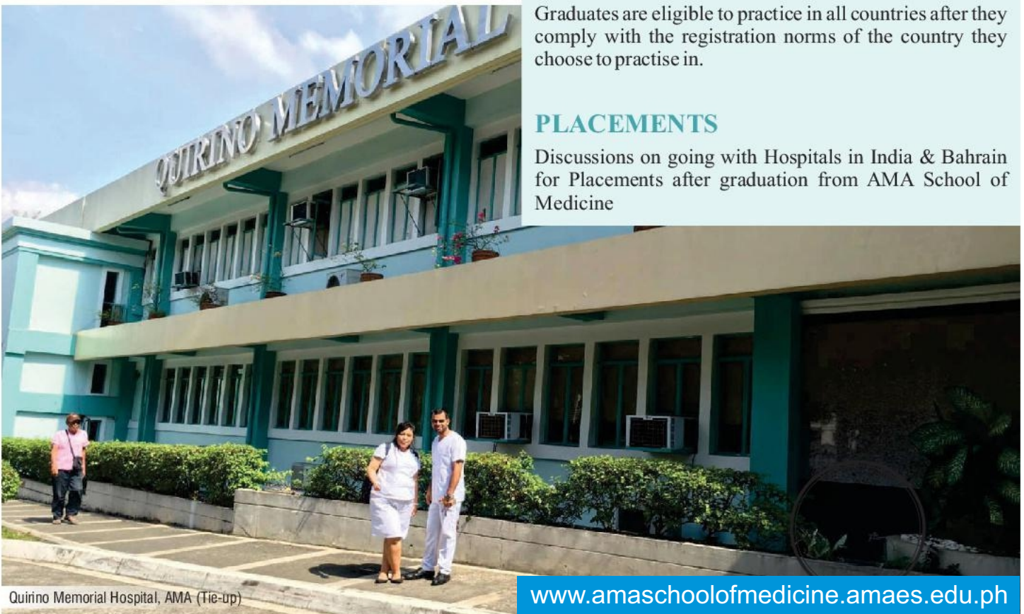
Quirino Memorial Hospital, AMA (Tie-up)

Discussions on going with Hospitals in India & Bahrain for Placements after graduation from AMA School of Medicine